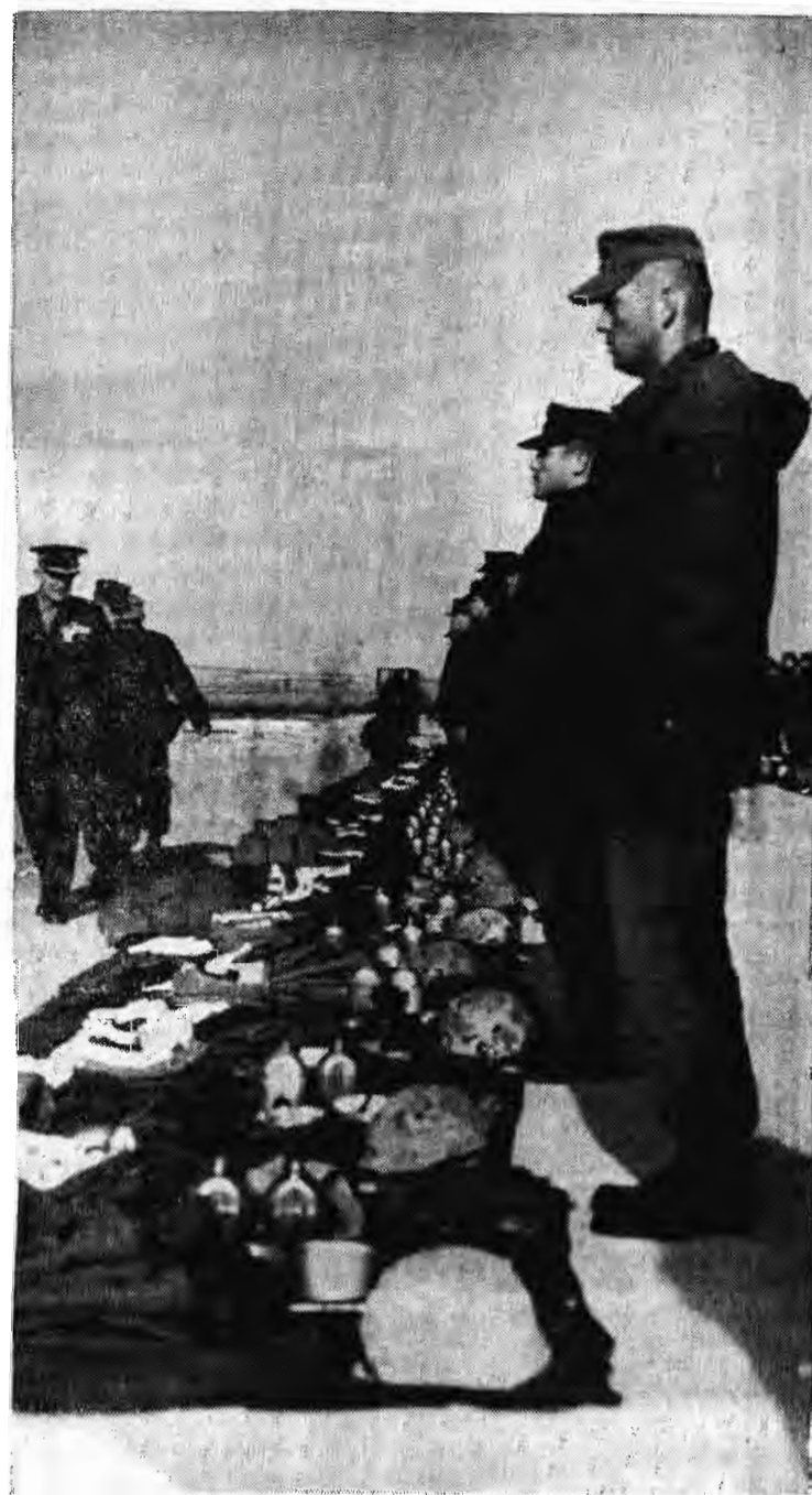
PACK INSPECTION — The commanding general inspects field transport packs of the 3rd 8" Howitzer Battery during recent mount-out exercises.

Thanks to the efforts of "D" Company, 7th Engineers, the big transport planes can now land right here eliminating the waste of time consumed transporting equipment of missile battalions to other air bases by motor convoy.