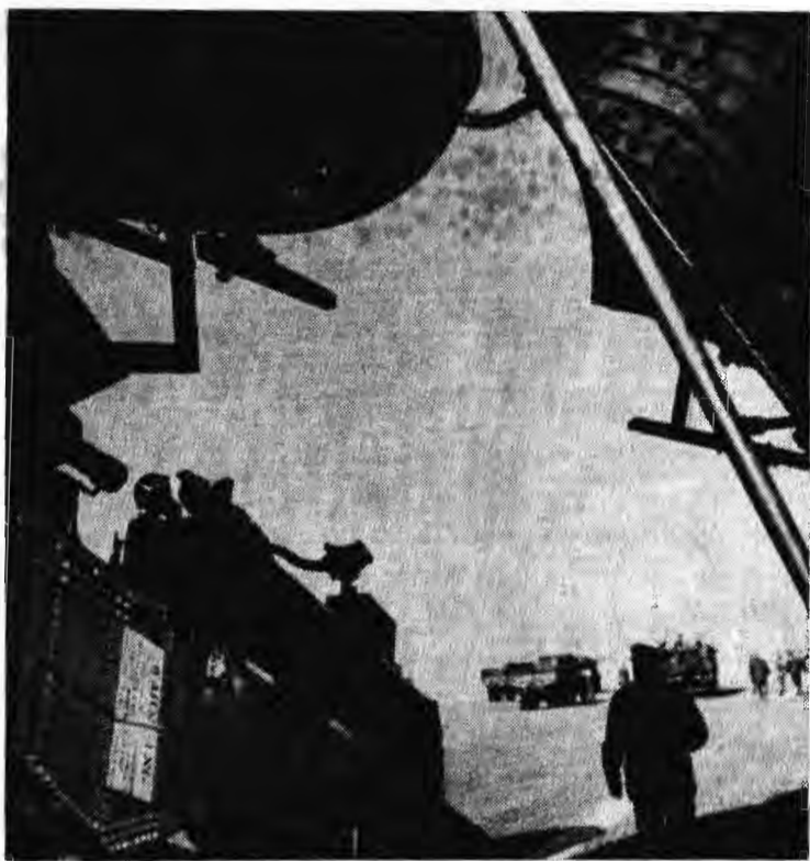
INSIDE THE MONSTER — The cameraman captures the jaws of the Globemaster II opening preparing to swallow another load of heavy equipment.