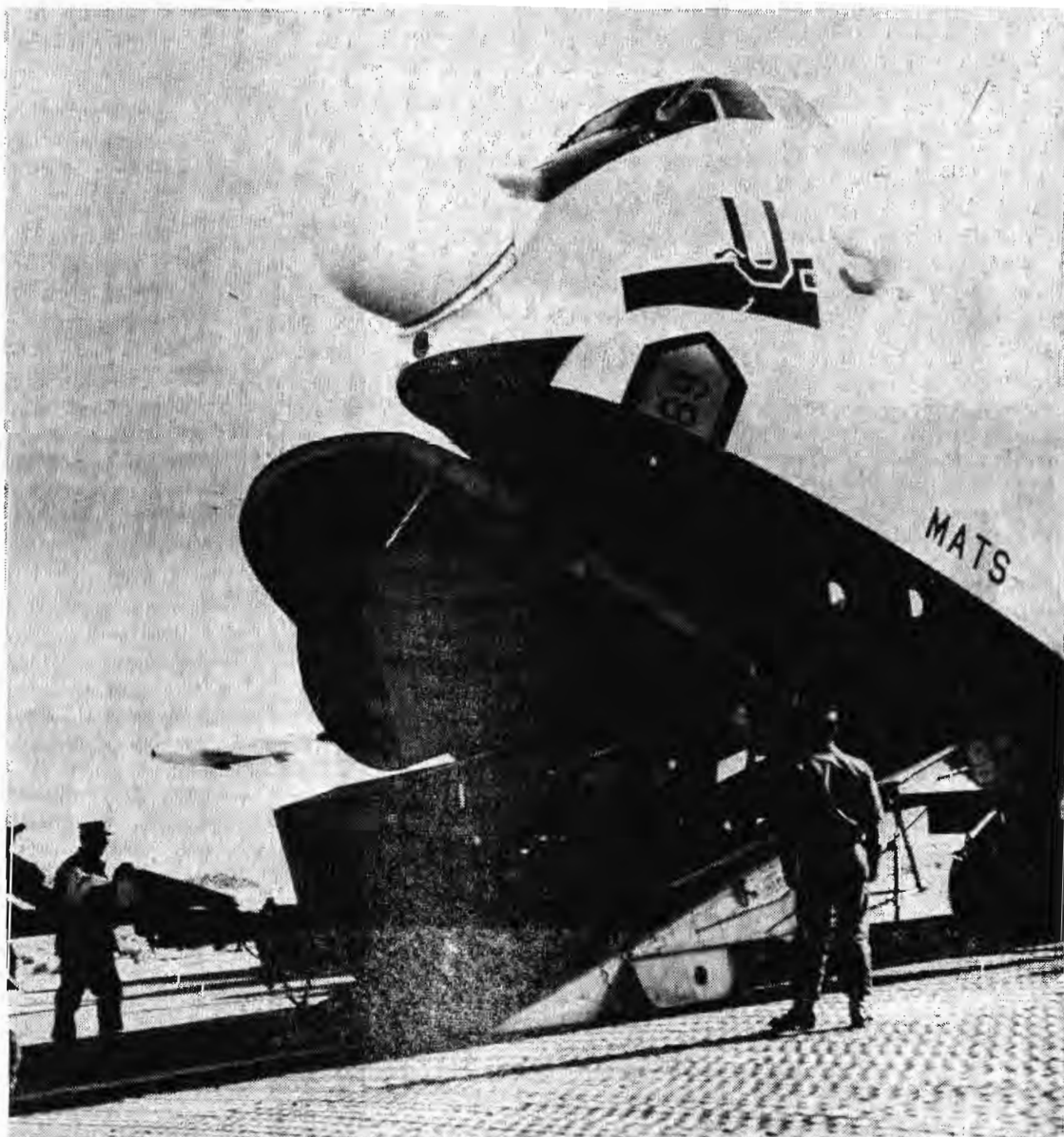
OPEN WIDE — Members of the 2nd LAAM Bn. load a Pulse Acquisition Radar aboard the Air Force C-124 Globemaster II during mount-out and loading exercises last week. The two-deck transport can be loaded by elevator from below and by the open nose as shown, as compared to the Corps KC-130F "Hercules" shown at left.